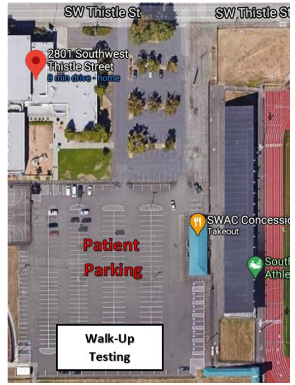
Satellite Image of West Seattle Test Site

Patients can walk up or park and walk to the test.